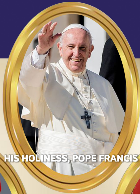
HIS HOLINESS, POPE FRANCIS